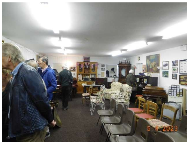
Part of “Large Shed”