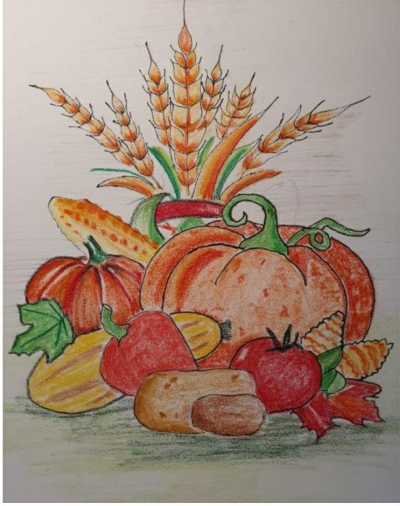
Peters "Harvest Table"