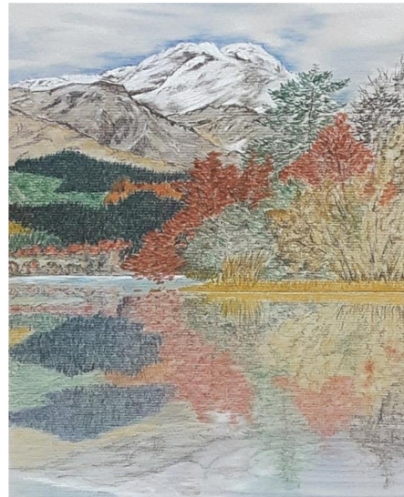
Wendys "Autumn Lake Reflection"