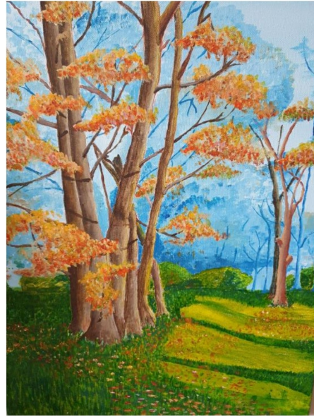
Peters "Autumn Gold"