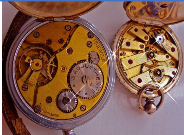
Photograph of the Month: Wheels by Dave Pask

u3abourne.org.uk REGISTERED CHARITY NUMBER 1100094