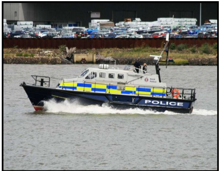
The Princess Alexandra III

The police were using a prototype lifeboat, The Princess Alexandra III, and two planning inflatable boats but both types had issues when it came to commodification, The Princess Alexander III was fibreglass construction and not visible on radar rendering it invisible to large shipping and coastguards and it along with poor maintenance of its and the inflatables radio masts were some of the problems that had to be corrected.