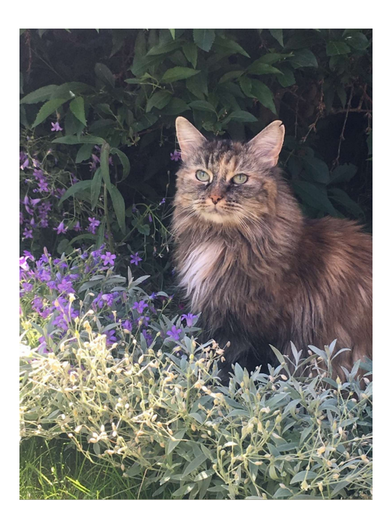
These pictures were the winning entries in the Photography Challenge "A Family Pet"