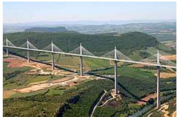
The Millau Bridge

Bridges can be anything from an old railway sleeper across a drain to the Millau Viaduct Bridge in France.