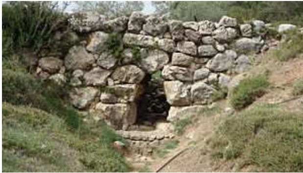
The Arkadiko Bridge